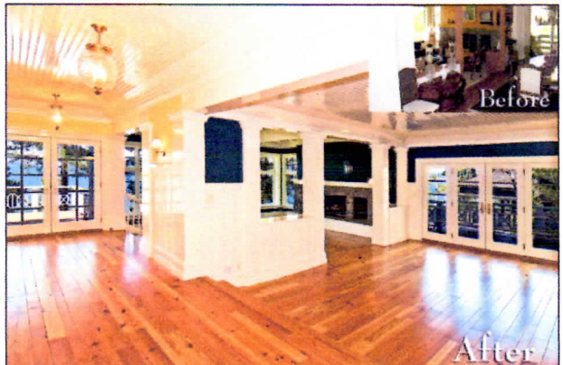
ABOVE: The renovated interior of this home is now bright and airy, keeping the focus on the stunning Lake Tahoe vistas outside.