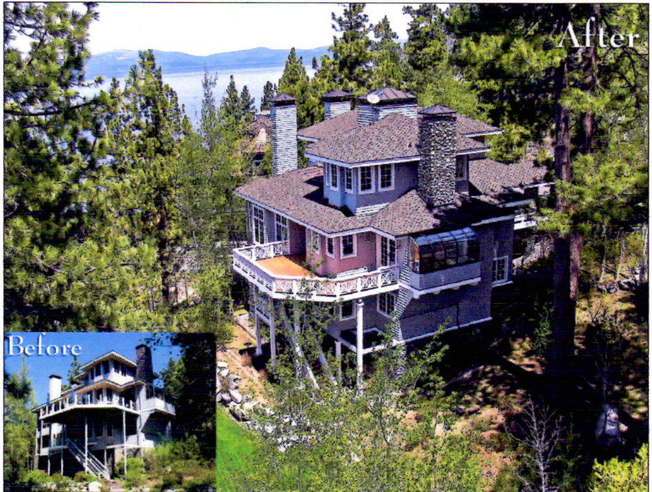
Changes in paint, trim, and window placement gave this home an fresh, new look.

HOUSES The homes having open is weekend. Page 19