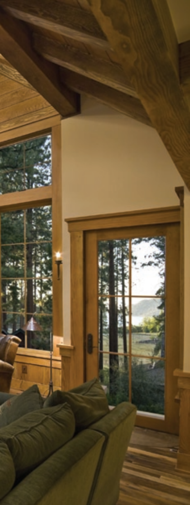
(above) The original house was gutted and spaces reorganized to take advantage of surrounding views. The great room's living area, formerly the home's entrance, offers a distant glimpse of Glenbrook Bay. (right) The lofty master suite boasts a sturdy timber beam vaulted ceiling.

great room, which flow into the well-appointed kitchen and breakfast nook. A master suite is at one end of the main floor, the billiards room—complete with wet bar and fireplace—and home theater on the other, ensuring Judy and Jeff quiet even when their sons have friends in town.